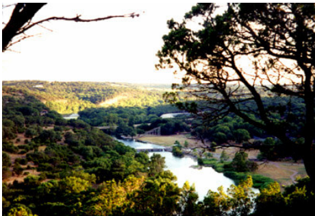
Views Of Mo Ranch